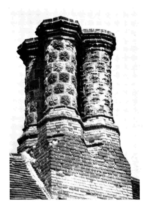
Clock House, Little Stonham.